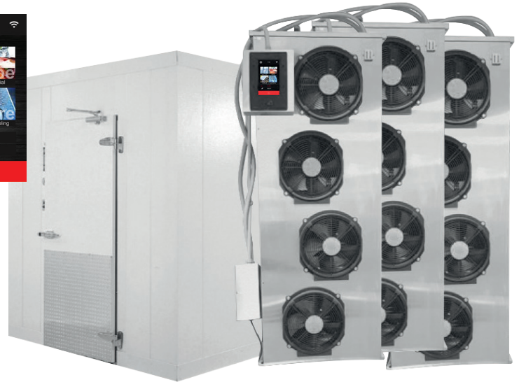
PBC1200-TS P/N 5980