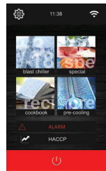
Touch screen controller

Standard features include an advanced touch screen controller with USB port, holding cycle (once your cycle is completed the unit automatically switches over to a cooler), a single point product core probe, and up to 99 customized recipe programs.