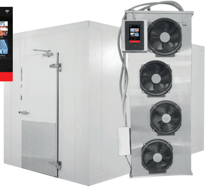
PBF450-TS P/N 4507